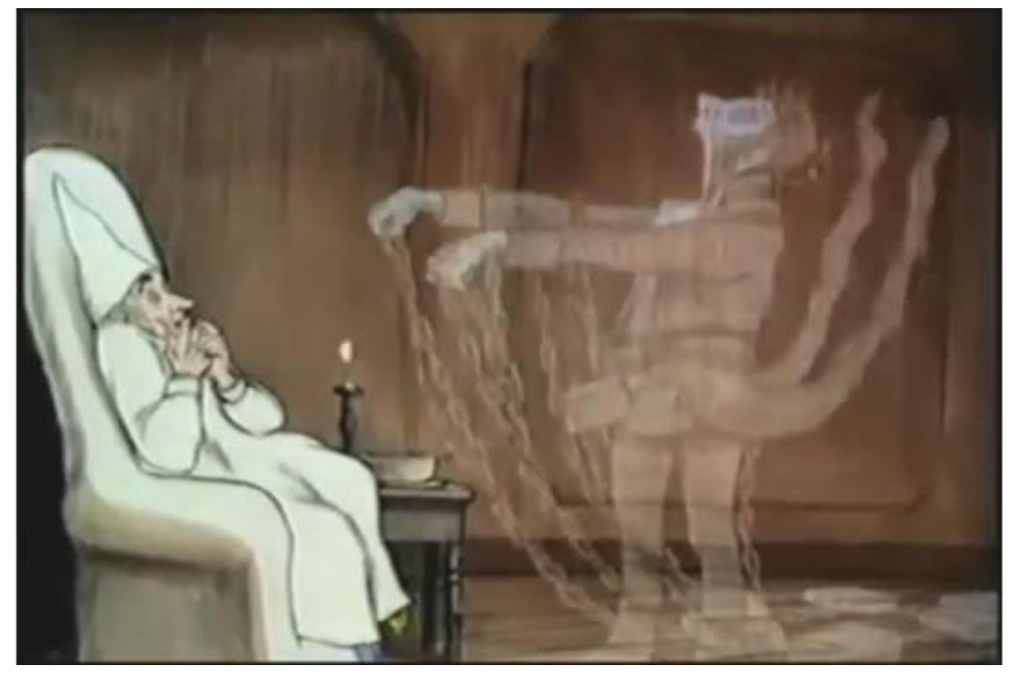
That night the ghost of Jacob Marley visited Scrooge. He told him that three ghosts would visit Scrooge that evening.